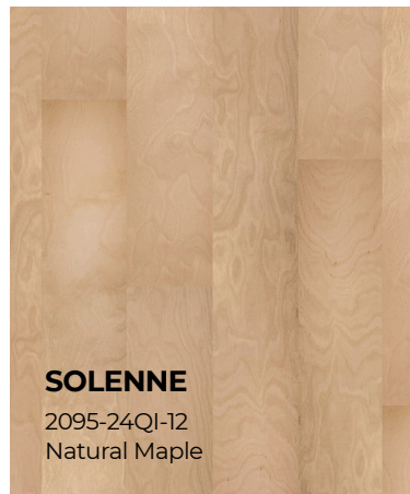
SOLENNE 2095-24QI-12 Natural Maple