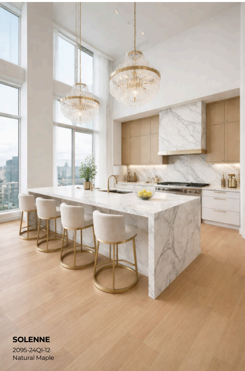
SOLENNE 2095-24QI-12 Natural Maple