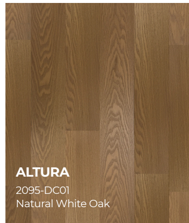
ALTURA 2095-DC01 Natural White Oak