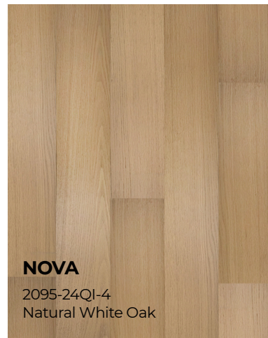
NOVA 2095-24QI-4 Natural White Oak